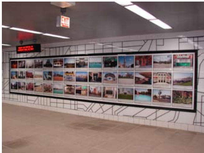
• Armitage Station, Chicago, IL Installer: Botti Studios Public arts commission created for the Chicago Transit Authority presenting photography by Jonathan Gitelson. Standing 10ft tall and 45 ft in width, the 42 digital imaged photos are laminated in the glass panels are adhered to the wall with white and black painted glass frames.