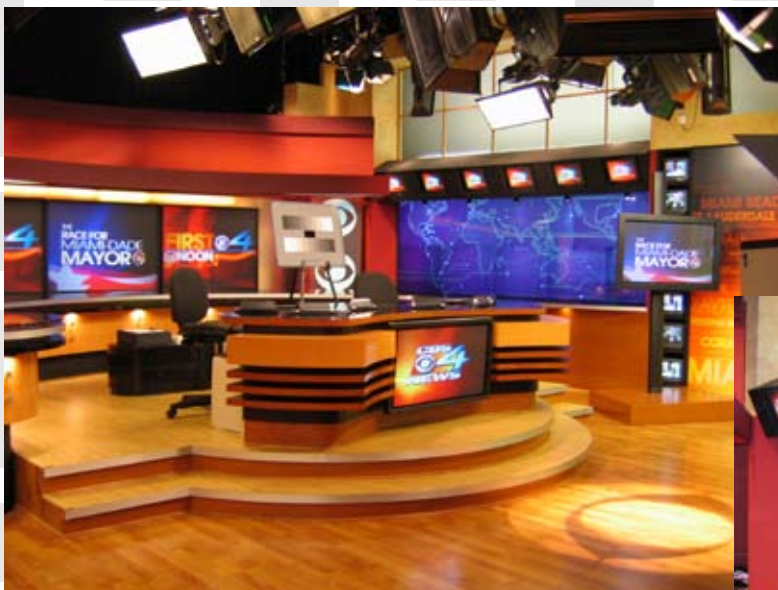
• WFOR - CBS 4 - Miami, FL Digital image world map design printed on a 4ft x 12ft panel for CBS Chanel 4 set.